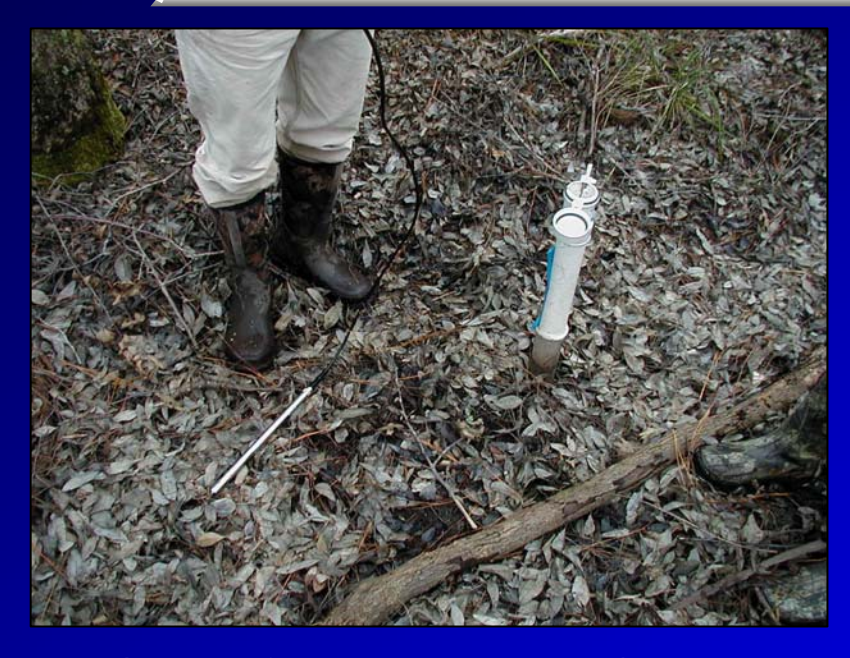
Service areas for Wetland and/or Stream Banks