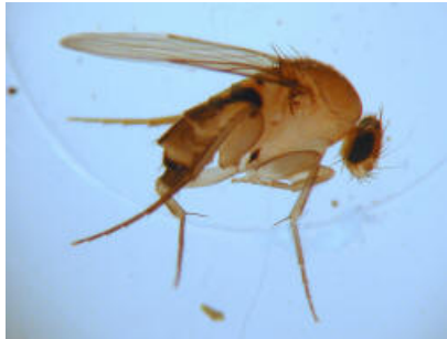
Hump-backed Fly Phoridae