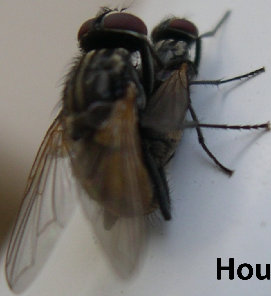
House flies Musca domestica