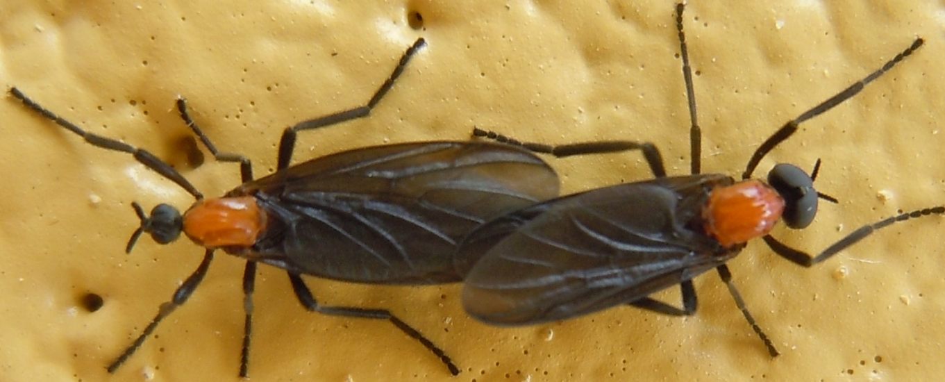
Love Bugs Bibionidae