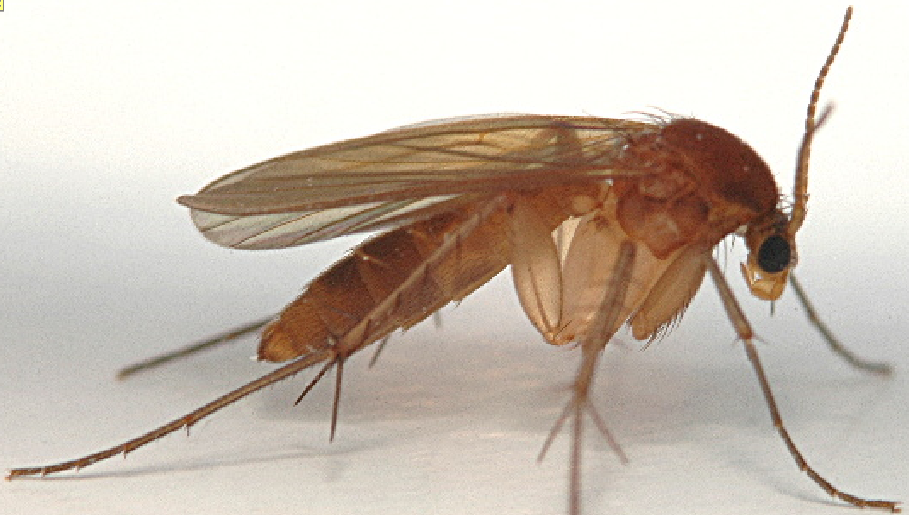
Fungus Gnat (Mycetophilidae)