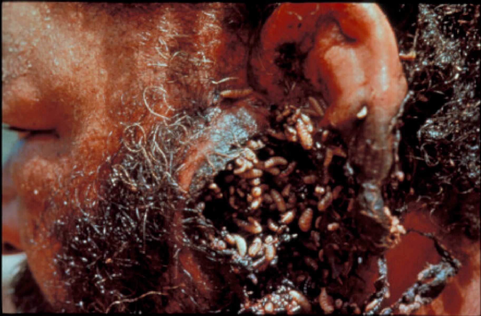
New World Screwworm