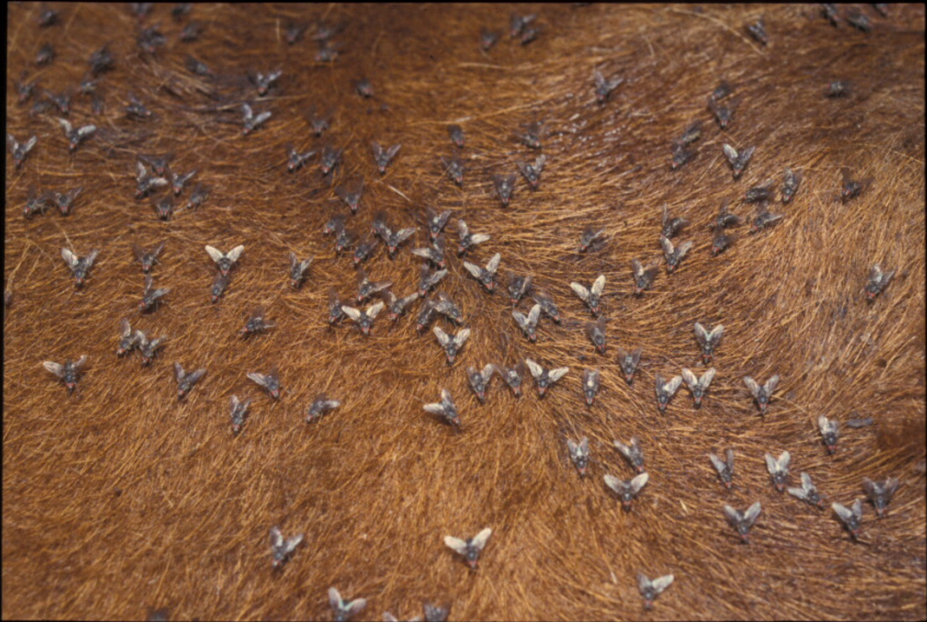
Horn Flies Haematobia irritans