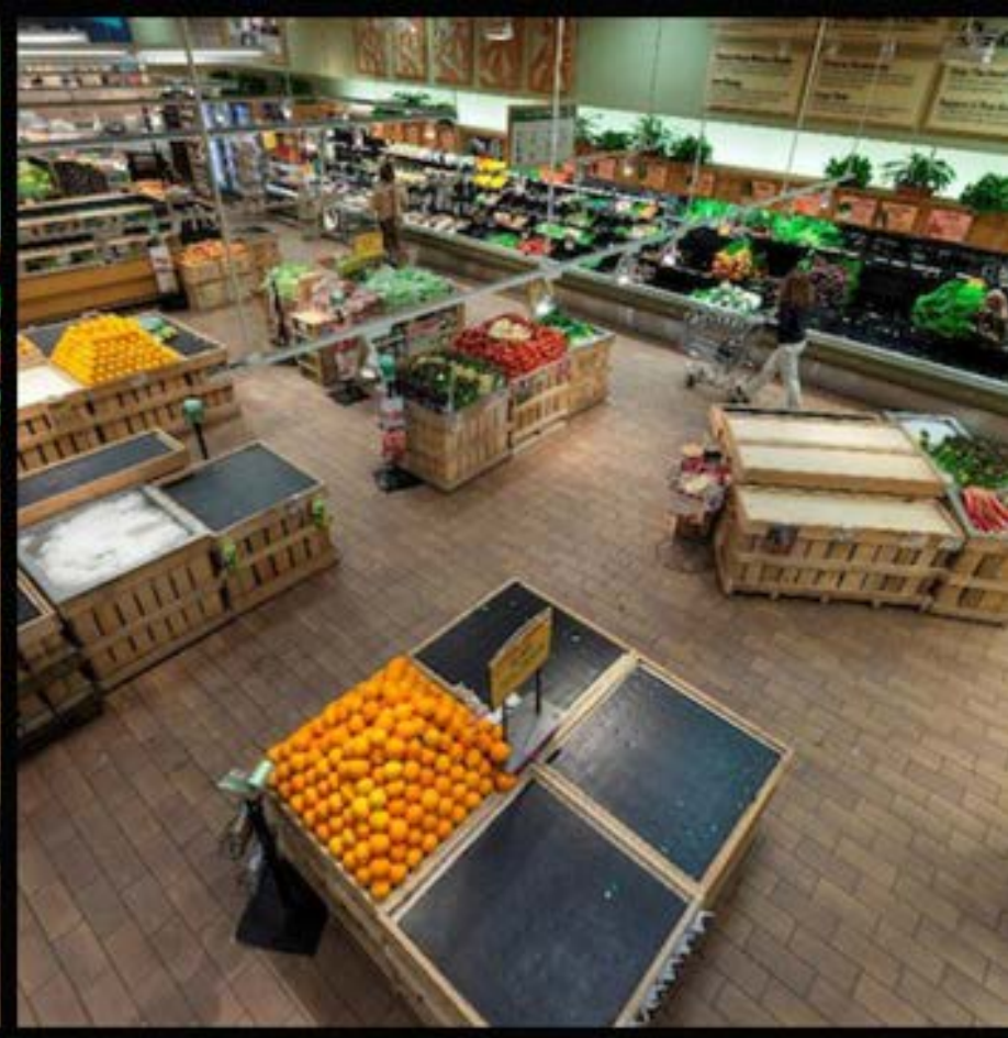
Photos from Whole Foods