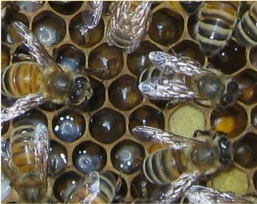
EGGS AND TINY C-SHAPED LARVAE